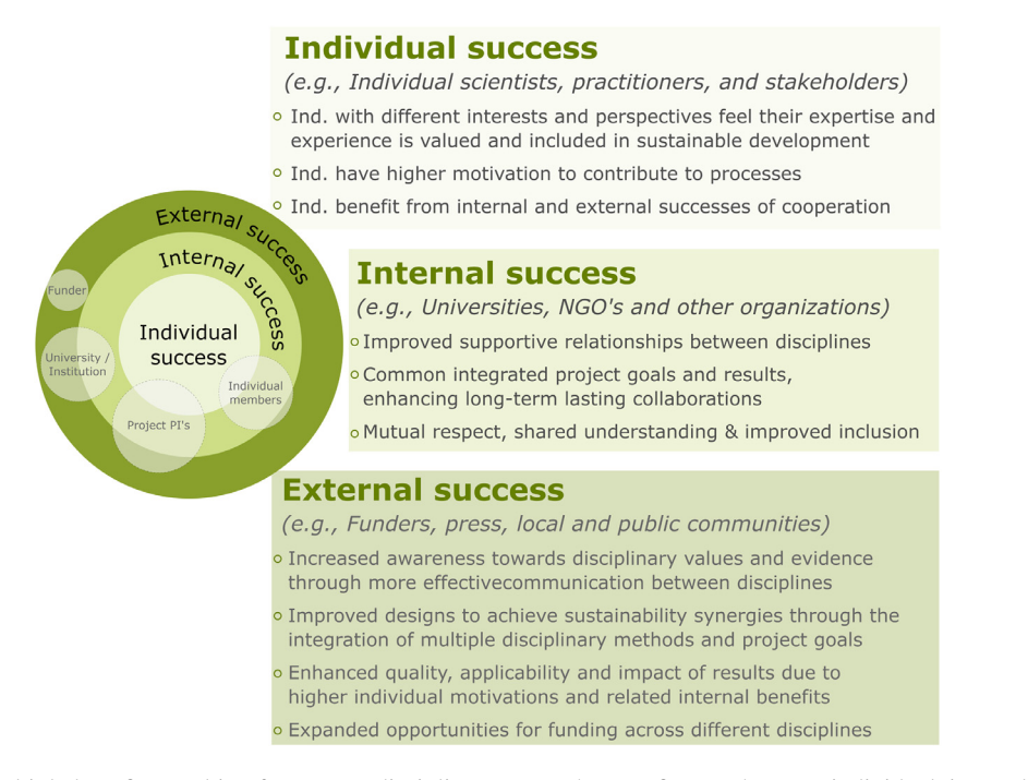
Fig. 2. Examples for multiple benefits resulting from cross-disciplinary research. Benefits are shown at individual, internal and external level of respective projects. Transparent circles represent examples of how individual components of a cross-disciplinary project can have varying degrees of anchoring in and overlap between these levels [adapted from Mallaband et al., 2017].